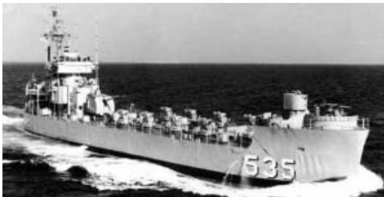
The original USS Trinity River (LSMR-535), sort of. This is actually a picture of the USS White River (LSMR-536). There are no photos of the LSMR-535 online or in Navy archives so we photoshopped this one just a teensy bit.